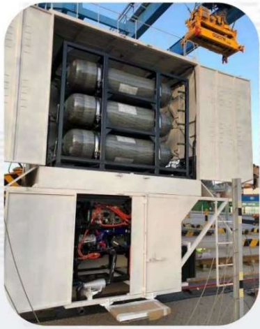
→ Qingdao Port--Tower crane