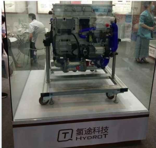
Zhejiang Hydrot Tech