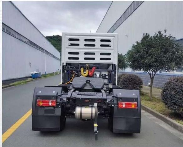
DONGFENG Port Truck