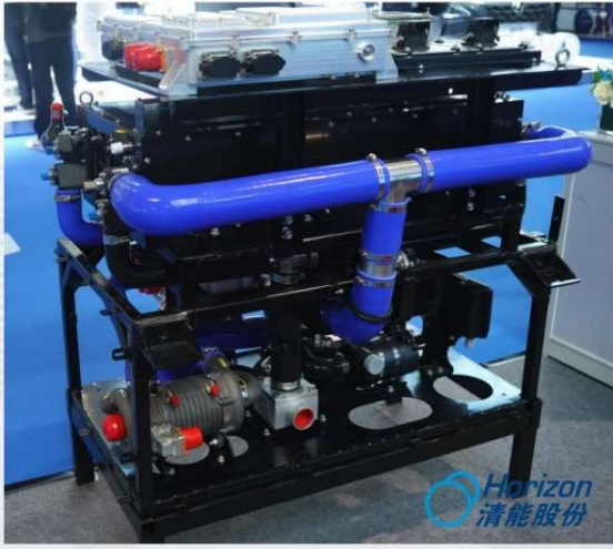
Horizon Fuel Cell Technologies