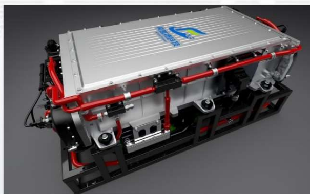
风氢扬科技 Great Power